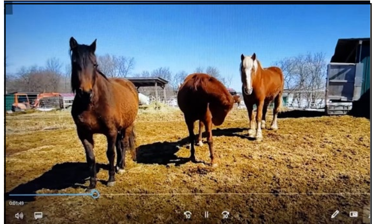
Video of Horse Speak showing the Backup Button in action. Click Here to Watch Video.

Price: $225 for Saturday & Sunday ($50 for just the Sat morning session. If you like what you hear, stay for the whole clinic. Just pay the balance)