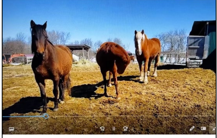
Video of Horse Speak showing the Backup Button in action. <u>Click Here to Watch Video.</u>

Learning Horse Speak® works with all disciplines, and changes the way you work with feral horses, young horses, traumatized horses, and helps when introducing new horses to a herd.