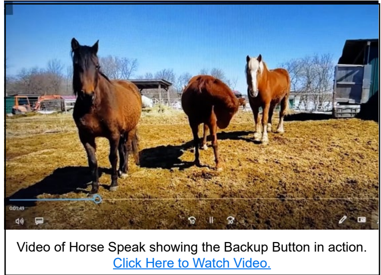
Video of Horse Speak showing the Backup Button in action. Click Here to Watch Video.

Price: $225 for Fri. evening, Sat. & Sun. ($50 for only the Friday evening session. If you like what you hear, come for the whole clinic. Just pay the balance)